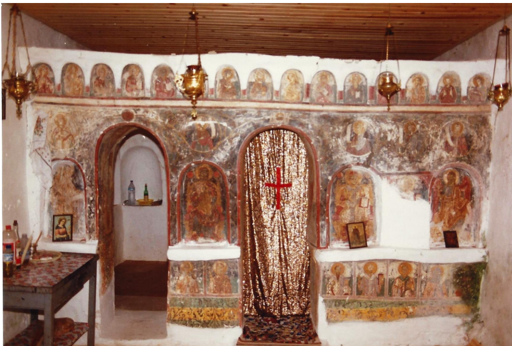
ICONOSTASIS, AGIOS GERASIMOS Built by Konstantinos Patrikios-Simpila