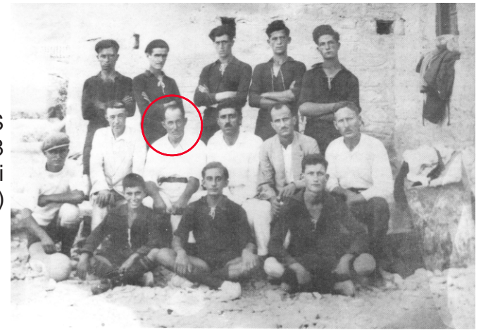
THE TRADITION CONTINUES